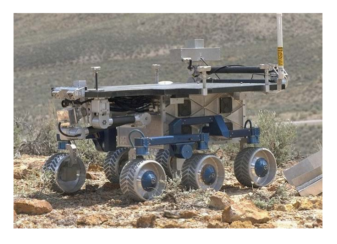
Fig. 4. The FIDO rover, which was used for testing.

includes a position estimation algorithm, which integrates IMU (Inertial Measuring Unit) measurements with wheel odometry to estimate rover position and attitude (roll, pitch and heading). Other used algorithms include mobility and stereo processing as well as control functions for mast pan/tilt and camera operation.