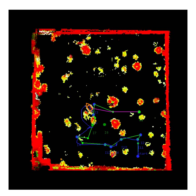
Fig. 6. Sample plan used in testing. Green lines show the planned path of the rover; blue lines shown the real path; and pink lines show the path that is currently executing.

Our testing scenarios often consisted of a random number of science targets specified at certain locations. A map was used that would represent a sample mission-site location where data would be gathered using multiple instruments at a number of locations. Figure 6 shows a sample scenario that was run as part of these tests. This particular map is of the JPL Mars Yard. The pre-specified science targets (shown in Figure 6 as the larger circles) represented targets that would be communicated by scientists on Earth. These targets were