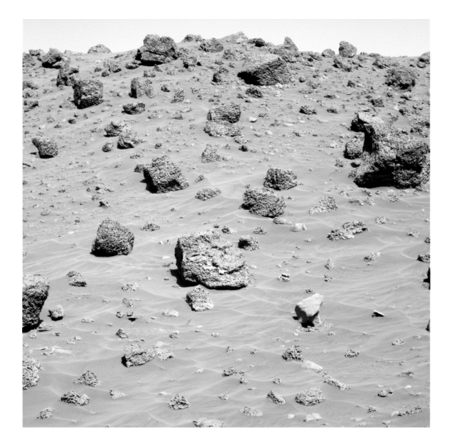
Fig. 1. View of the Dome Fuji target on the Mars surface taken by the MER Spirit rover.

rover resources over longer periods but also for enabling data collection opportunities that might have never been realized had the autonomy software not been onboard. New missions are being designed that will require rovers to support more autonomous endeavors such as long-range traversals, complex science experiments, opportunistic science handling, and lengthy mission durations. To address these goals, autonomy software designers face a number of challenges. In this section, we consider a few key challenges for using planning and execution techniques to provide extended rover-autonomy capabilities.