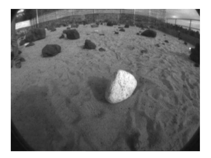
Fig. 5. Image taken in response to a science alert on the JPL FIDO rover. In this test, science alerts were generated for "high albedo" (or light-colored) rocks.

Science alerts can have different levels of reaction in OASIS. The most basic reaction is to adjust the rover plan so that the rover holds at the current position and the flagged data is sent back to Earth at the next communication opportunity. The next level of reaction is to collect additional data at the current site before transmitting back to Earth. Further steps include having the rover alter its path to get closer to objects of interest before taking additional measurements and taking a close-contact measurement.